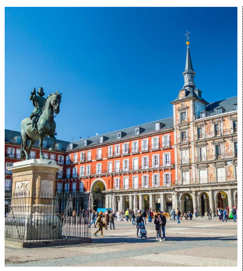
17 Days • 25 Meals: 15 Breakfasts, 1 Lunch, 9 Dinners

HIGHLIGHTS... Madrid, Córdoba, The Alhambra, Antequera, Seville, Flamenco Show, Tangier, Chefchaouen, Fes, Marrakech, Choice on Tour: Hike or M'Goun Geopark Museum, Bin El Oudaine, Casablanca, Hassan II Mosque